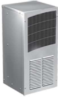
T15 800 BTU/Hr. 234 Watts