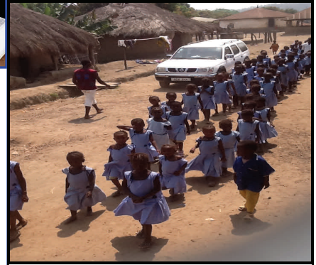
This picture is (some of) the same kids in their uniforms and wearing sandals heading to their new school.