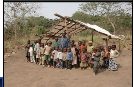
This picture is the original structure of a few sticks, torn tarpaulins and school kids with torn clothes running to school barefoot.

The Pauls Valley & Wynne-wood Tornado alarm will be 1 long continuous blast.