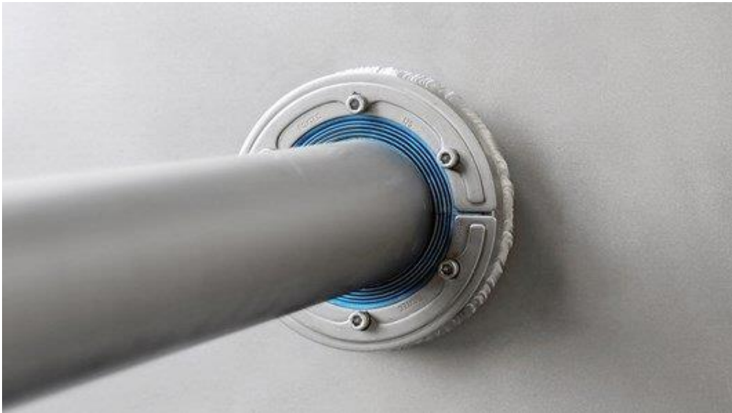
Single cable/ Pipe