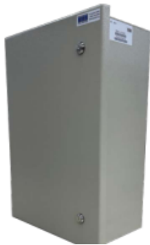
View SBS Series

DDB enclosures are available in NEMA 3R, 4, and 4X configurations and are built using the company's Alumiflex marine-grade aluminum alloy, offering strong corrosion resistance with lower weight than many traditional cabinet materials. DDB Unlimited manufactures in the United States under ISO 9001-certified processes, backs its enclosures with a 15-year warranty, and maintains fast availability for many standard products, including shipment timelines as short as 3-5 business days.