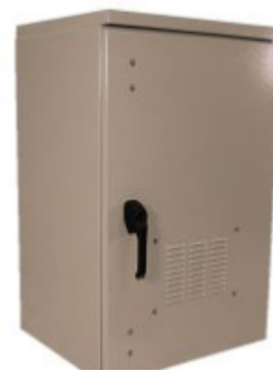
View SOD Series